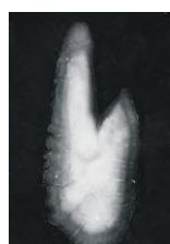
Catch: June TL: 21.4 cm Age: 1

However, in some months (April–June) scales are very useful due to the better observation of the new growth zone on the edge.